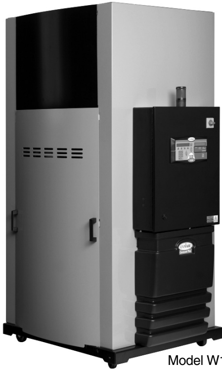
Model W1000 shown with DC-2 controls and the audible and visual alarm package.